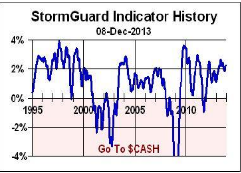
Learn More About StormGuard