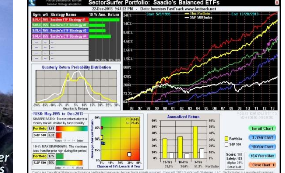
Click Chart to See Portfolio Details